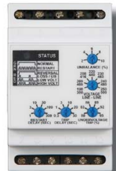
PMD Series DIN-Rail Mounted Meets IEC/DIN enclosure design standards