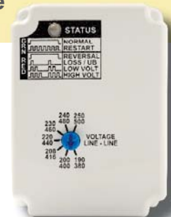
PMPU-FA8 & PMPU-FA8X Series