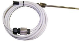
Shielded RTD Cable